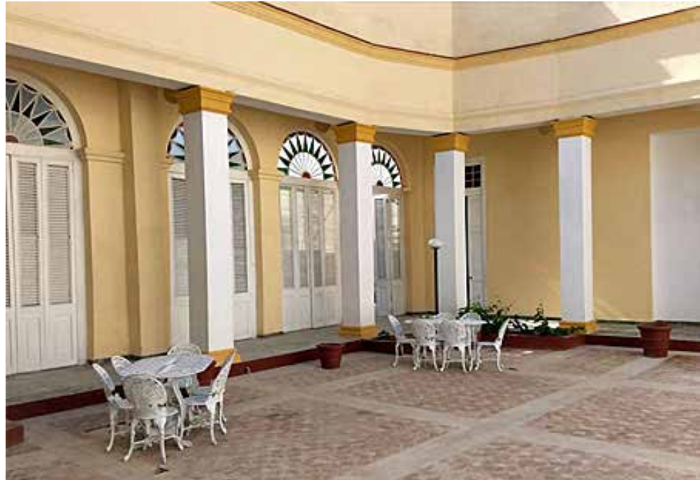
Interior courtyard at Haydee Santamaria Gallery.

The program aims to ensure that students will return with an invigorated sense of inquiry, a better understanding of the complex situation facing Cuba today, and a wealth of knowledge obtained through in-country learning experiences that will challenge you in many ways, taking you beyond your comfort zone and teaching you more than you ever imagined.