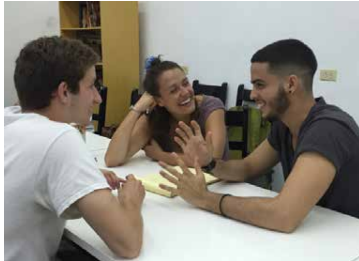
US CASA Program and Cuban students at the weekly language tandem

Just as it is impossible to define a typical American, it is equally impossible to define a typical Cuban. You will meet many types of people in Cuba who have different opinions, attitudes, and habits. The more you interact with Cuban people, the better chance you will have of forming relationships and understanding the culture. During these interactions, use common sense, intelligence, and a sense of objectivity. Be prepared to discuss your views freely and openly, try to listen with an open mind, and be respectful of others' views, no matter how much they may be different from your own.