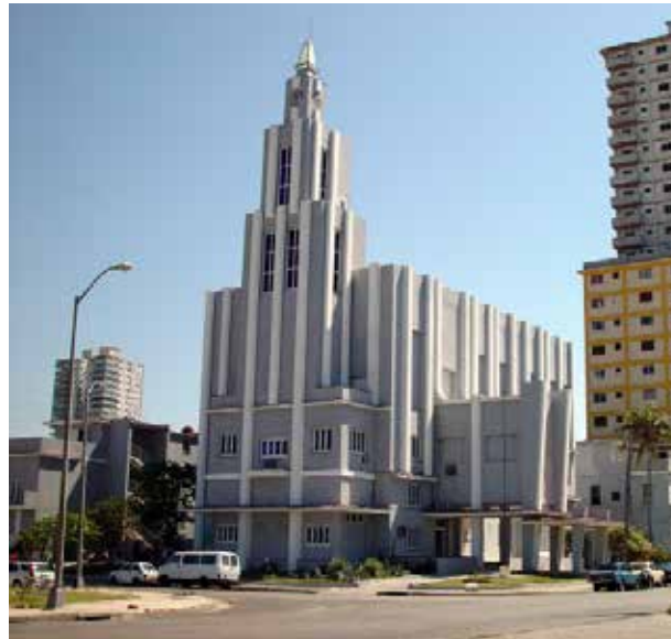
Casa de las Americas