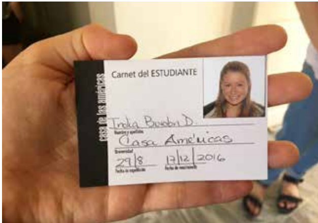
Student identity card provided by Casa de las Americas

The CASA program will cover the cost of hotel accommodations for Saturday and Sunday nights and all meals and excursions related to the program in Miami.