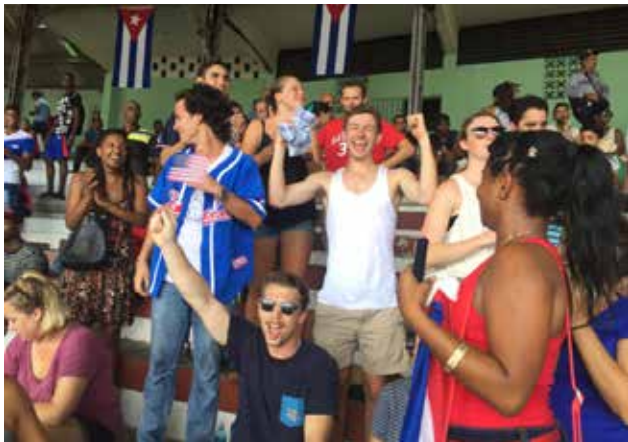
Cuban and Program students at a US-Cuba soccer match

Even though Havana is right on the Caribbean Sea, the atmosphere is far from that of a "beach town." Havana is a Latin American capital city; people place a great deal of emphasis on looking their best in public. Cubans generally dress as well as they can afford. People, especially women, "put themselves together" considerably more than U.S. students, even for activities you might think of as informal—going shopping on a Saturday, going to the movies, etc. In addition to dressing well, there is a lot of emphasis placed on grooming, especially for women.