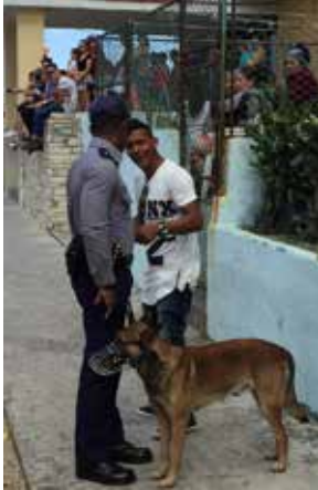
Cuban Police securing major musical event near the US Embassy

When traveling abroad, you should exercise additional caution until you become familiar with your new surroundings. Always remain alert to what is going on around you, especially in crowded tourist areas and on public transportation.